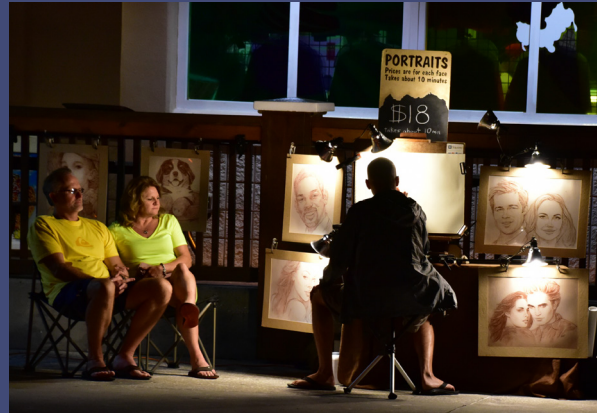
Below: A little evening relaxation after a full day of education.