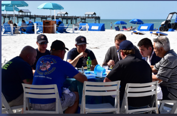
Above: Lunch on the beach sponsored by AT&T.