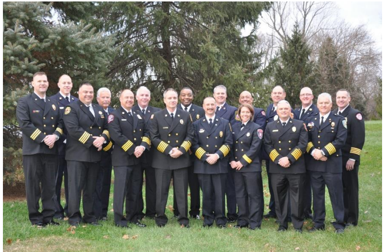
The 2018 Fire Service Executive Development institute (FSEDI) met for their 3rd and final session of their basic program in Leesburg Virginia, Dec. 1-5.