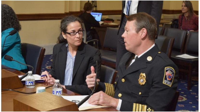
Chief Dan Eggleston testified before the House Homeland Security Committee's Subcommittee on Emergency Preparedness, Response and Recovery about the homeland security impacts of a changing climate.